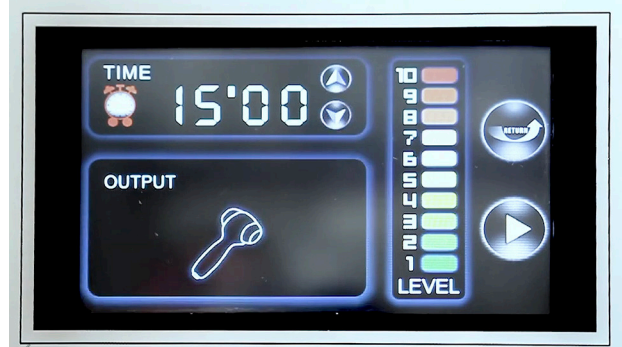
COLD AND HOT HAMMER