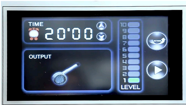
MICROCURRENT WITH LED LIGHT THERAPY