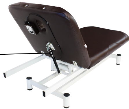
Table paper holder included